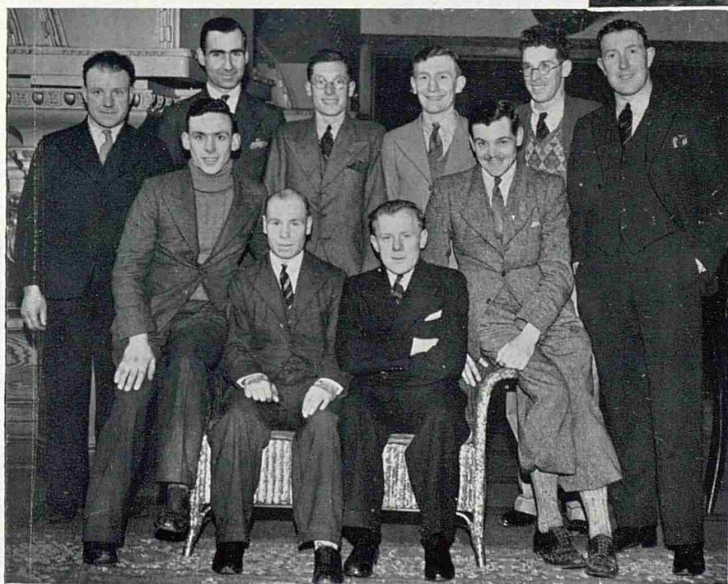
RUNNERS-UP IN THE RELAY RACE: Maryhill Harriers came home in second place in the Edinburgh-Glasgow relay race, receiving silver medals for their performance. This was the first occasion on which they had come so near to success, occupying third place in the contest of 1934.